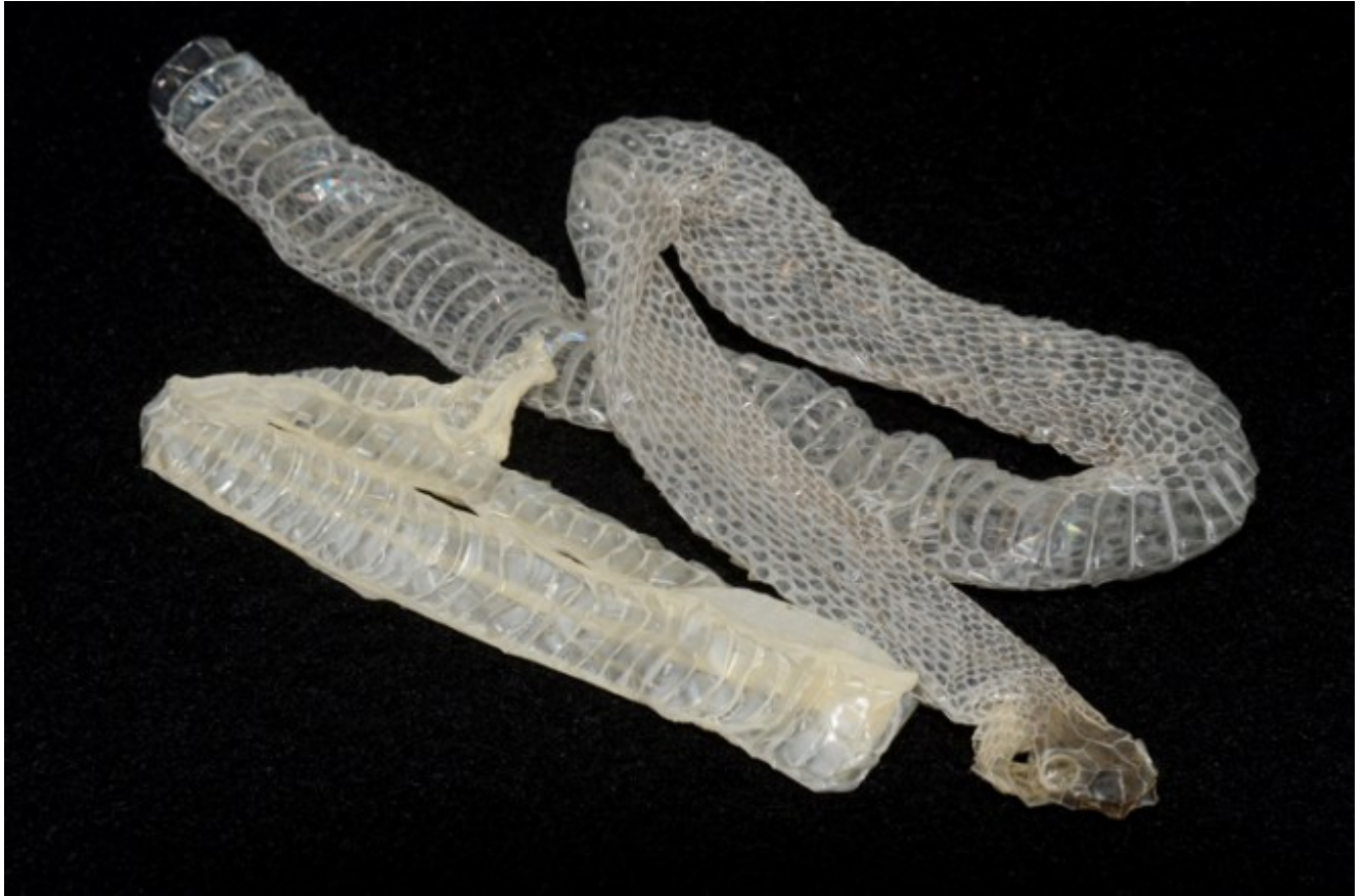
Same two partial sheds (scaleless version lower-left)..